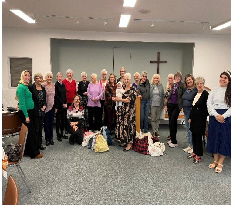
Job well done by this amazing group of ladies who made bags and filled them with necessary items to support the women's shelter here in West Kelowna! They were so appreciated by all the ladies who received one.